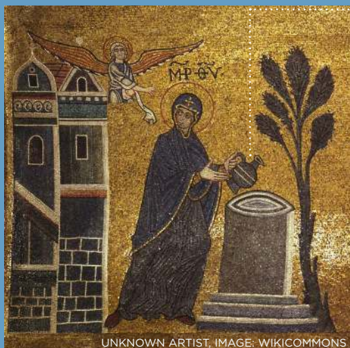
UNKNOWN ARTIST

The Annunciation (April 4 this year due to Good Friday) is a poetic and highly mystical event in Salvation history, lending itself to a variety of artistic interpretations. Each of these interpretations has served to stress a different theological truth of the interaction between the Virgin Mary and the Angel Gabriel.