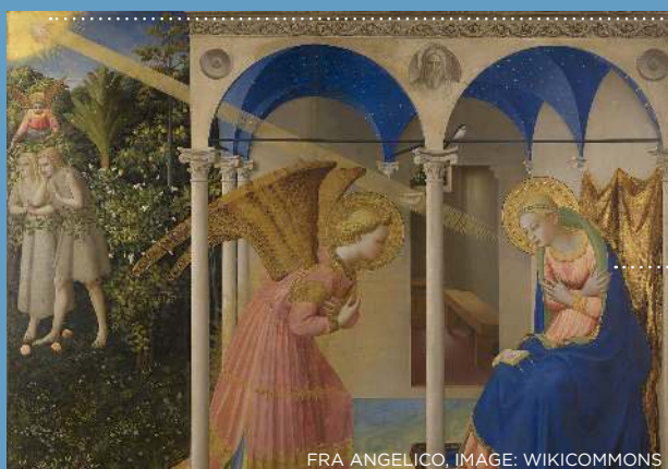
FRA ANGELICO

Adam and Eve's expulsion from Eden necessitated Christ's arrival and eventual Passion. The Holy Spirit, pictured here as a dove, lets out a ray of light that passes through the Garden of Eden before touching Mary.